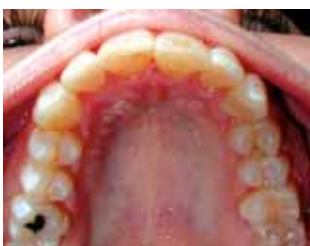
After two Bioliners.