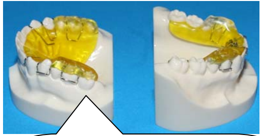
To gain posterior vertical development, the upper bite block of acrylic is gradually relieved at each patient visit to allow for lower molar eruption.

Dr. William Clark, an Orthodontist has developed a simple solution that incorporates the use of upper and lower bite blocks to reposition the mandible forward for skeletal Class II correction.