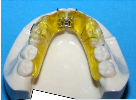
Five Star adds acrylic to the posterior region for added retention and improved expansion.