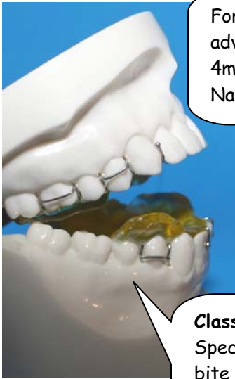
For mandibular advancement less than 4mm consider a Rick O' Nator.

The Twin Block can be fabricated as a fixed or removable appliance. The Twin Block is extremely versatile. It is used to correct Class II Division 1, Class II Division 2, Class I open bites, Class I closed bites, lateral arch constriction, and anterior/posterior arch length discrepancies. The Twin Block design allows for independent development of the maxillary and mandibular arches with the addition of transverse and/or sagittal screws.